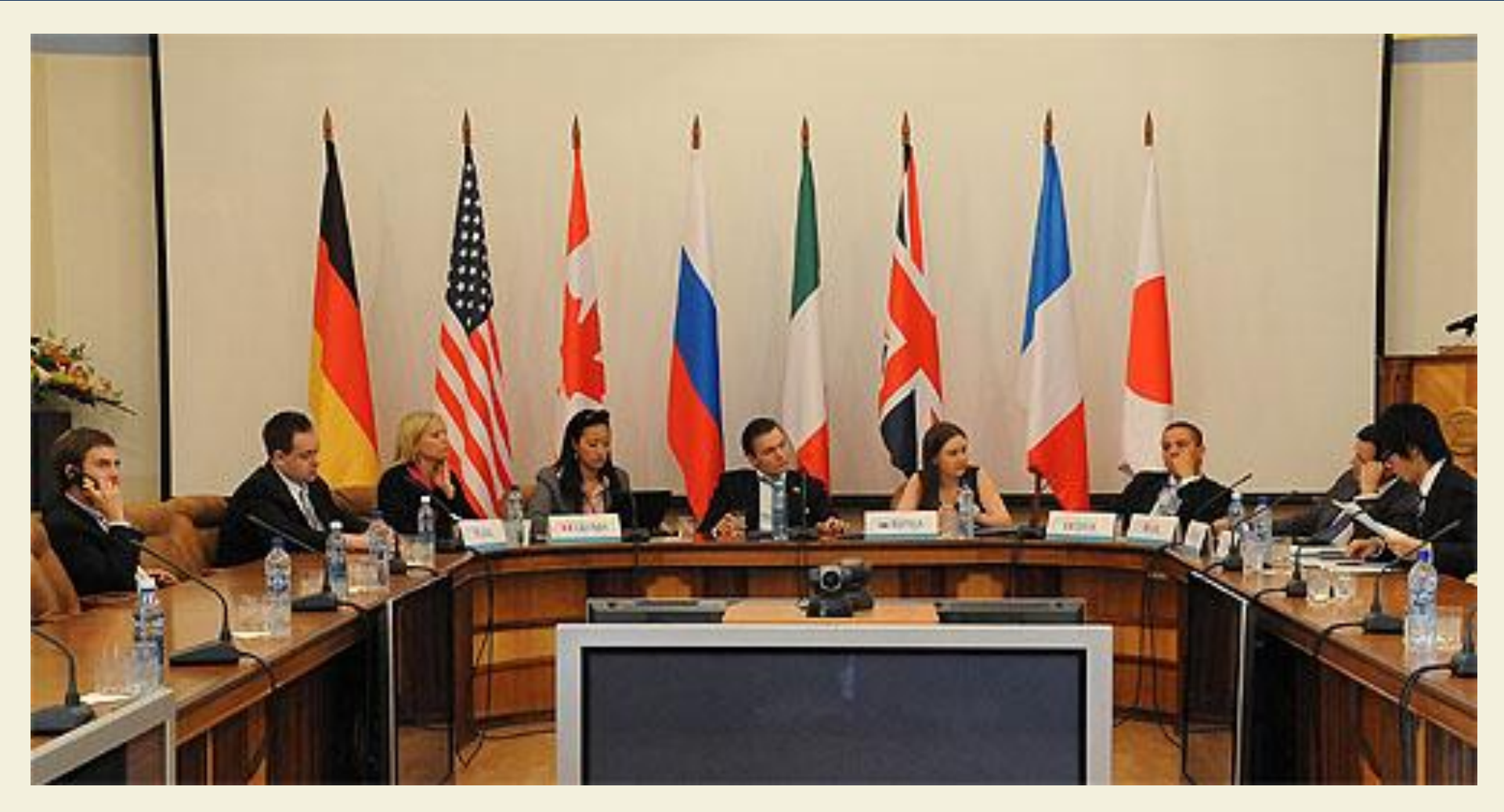
Youth leaders from G8 countries visiting the Presidium of SB RAS